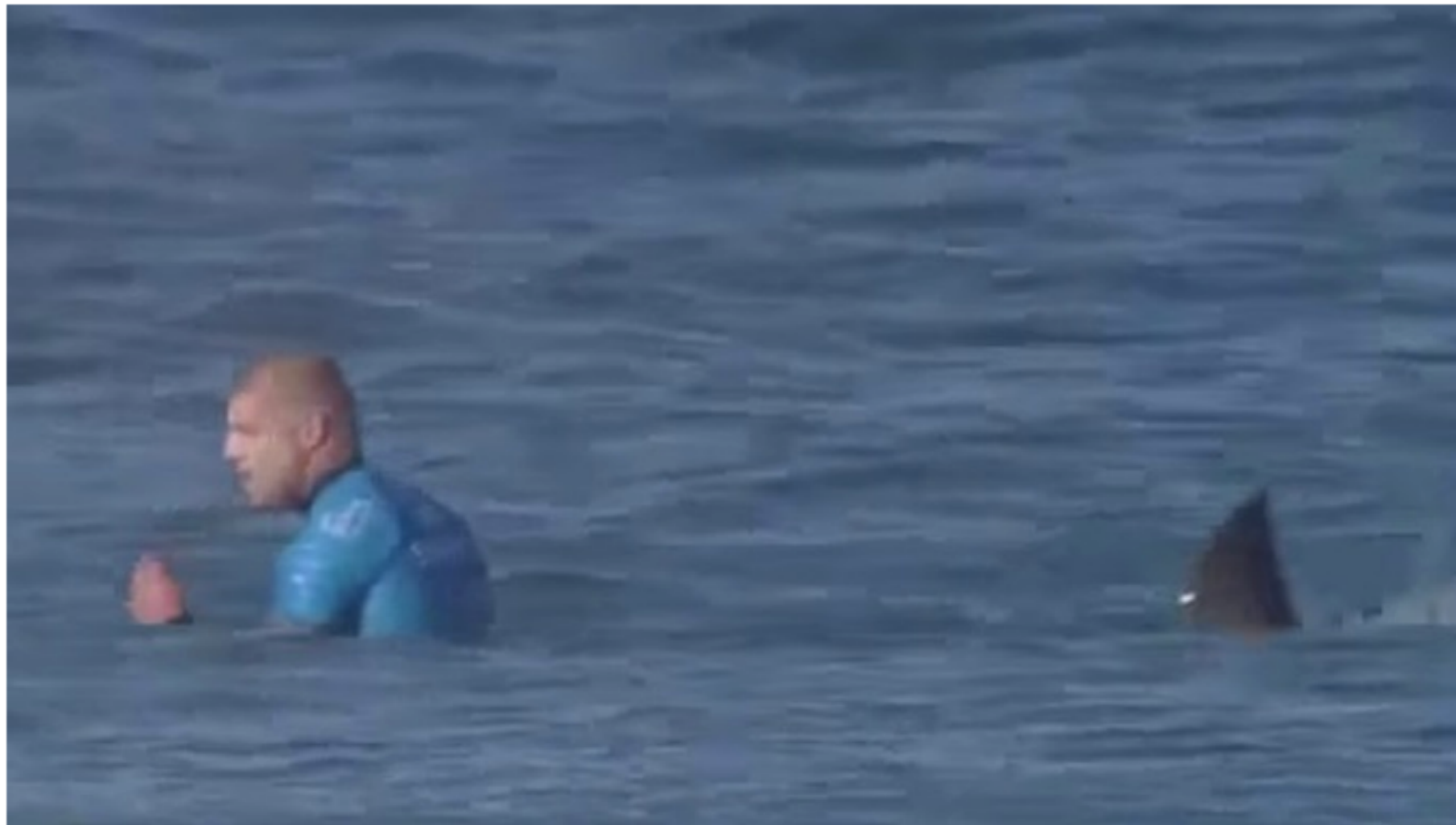
Surfer Mick Fanning was attacked by a shark mid-competition